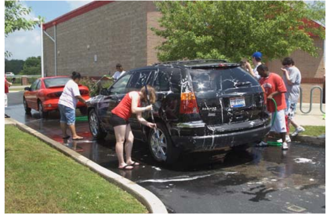
June 14 Car Wash raised $345. The kids even got to wash a semi!!!!!!!